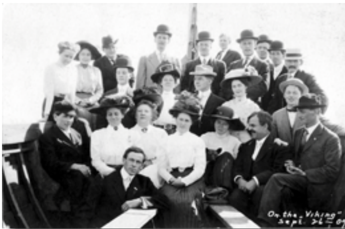
AYP Expo participants on board the Viking ship.