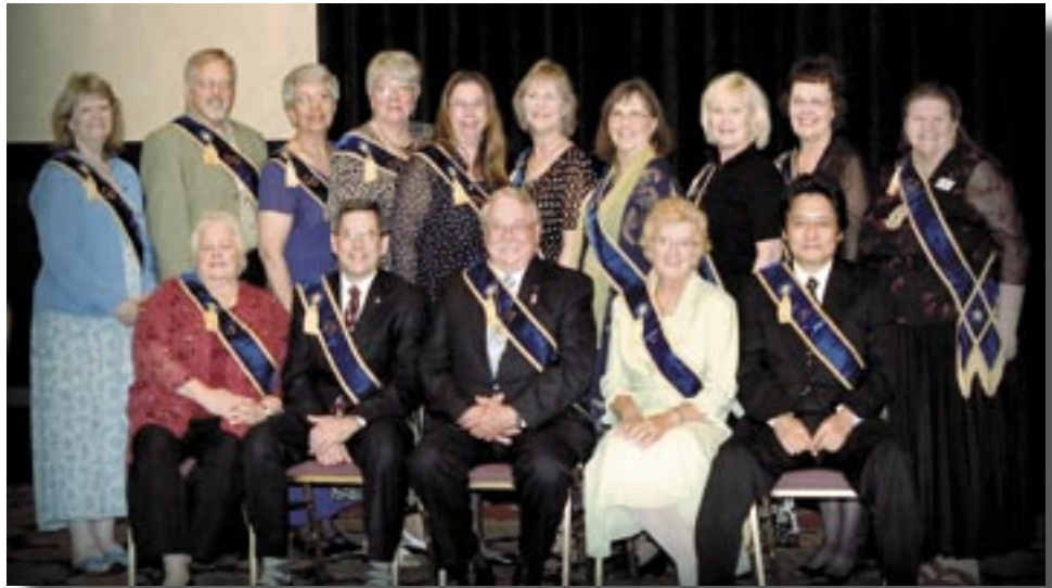
Your District 2 Board of Directors.