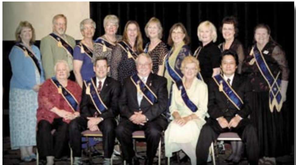
Your District 2 Board of Directors.